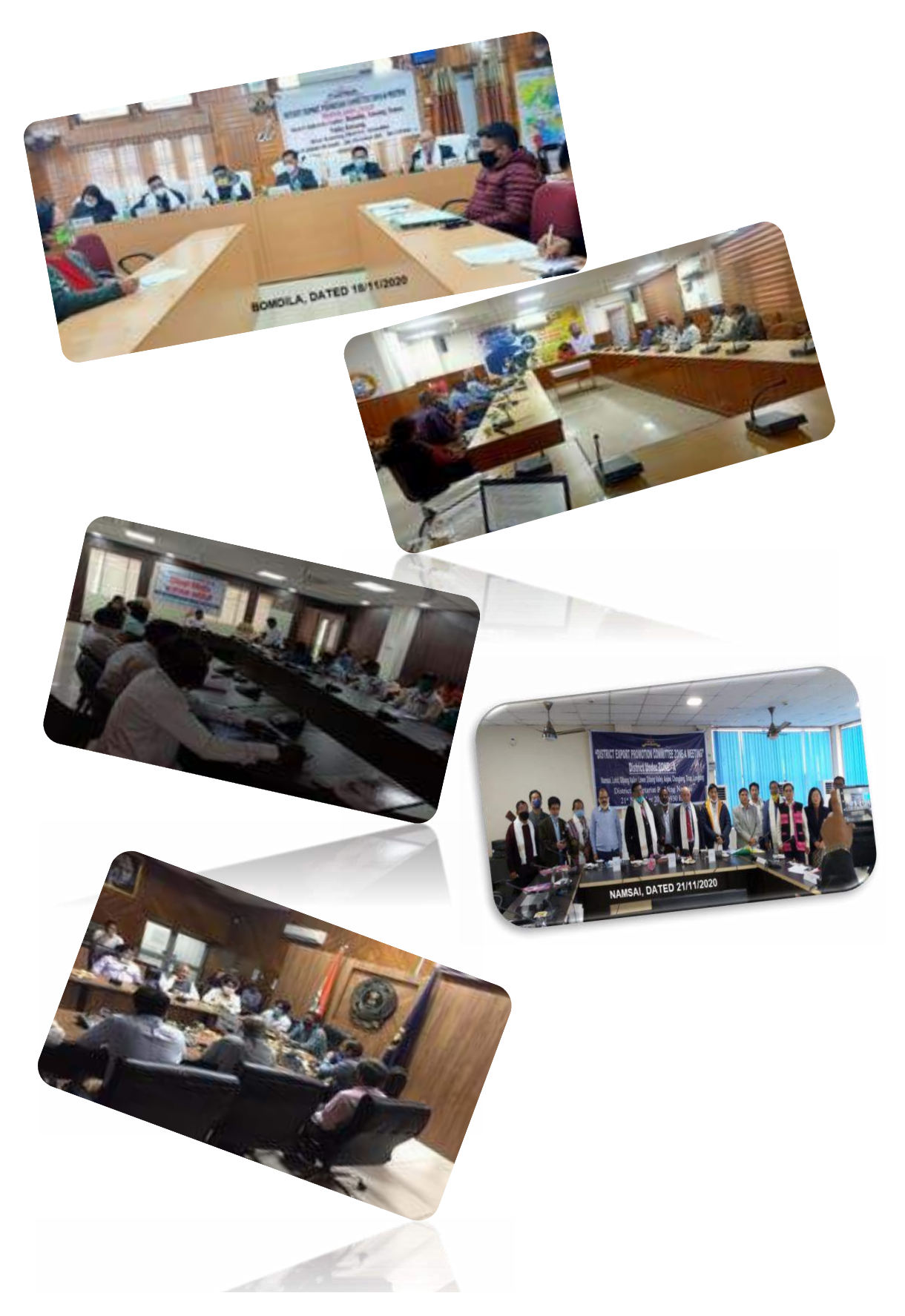
Page 5 of 8