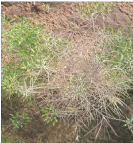
Reddening in cumin