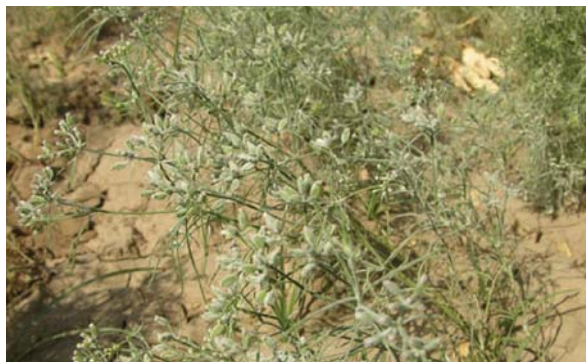
Powdery mildew in cumin

This is caused by Erysiphe polygoni . The fungus is ectoparasite on aerial plant parts resulting in yield losses up to 50% under favorable weather conditions. Application of neem oil and garlic extract is also effective to reduce the disease. The disease appears in February and March at flowering. The disease spreads fast under warm (27-35°C) and moist conditions. The incidence is characterized by appearance of whitish spots on surface of leaves, petiole, stem pedicel and seeds in the early stages. Gradually seeds become white, shrivelled and light in weight. The late sown crop under irrigated condition gets severely affected. The fungus perpetuates as dormant mycelium on the seed. Under severe disease situation total failure of the crop has been observed.