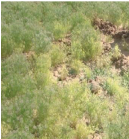
Yellow disease in cumin

Reddening of the plants is also seen as a new and emerging problem in all the cumin growing areas. This problem starts since early stage of the growth and continues up to maturity. Primary studies explain that this is a physiological and environmental problem in cumin.