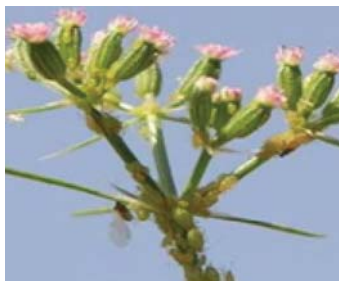
Aphids on cumin

Aphid is a major pest of cumin with heavy infestation occurring between the months of December to March and causing a loss of more than 50% of yield in unprotected crop. When the aphid infestation occurs at flowering and fruit stage, the fruits are not formed and even if they are formed, they are shriveled and of poor quality.