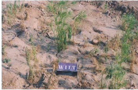
Wilt affected field

The inoculum of the pathogen increases under continuous cultivation of cumin in the same field (monoculture). The pathogen survives in soil through hyphae and chlamydospore which is heat tolerant. Under moist condition the lethal temperature range is 60-62°C and under dry conditions it is 62-65°C. The wilt disease is enhanced when Meloidogyne incognita attacks earlier than wilt pathogen. Efficient control of this disease is not possible by the use of chemicals.