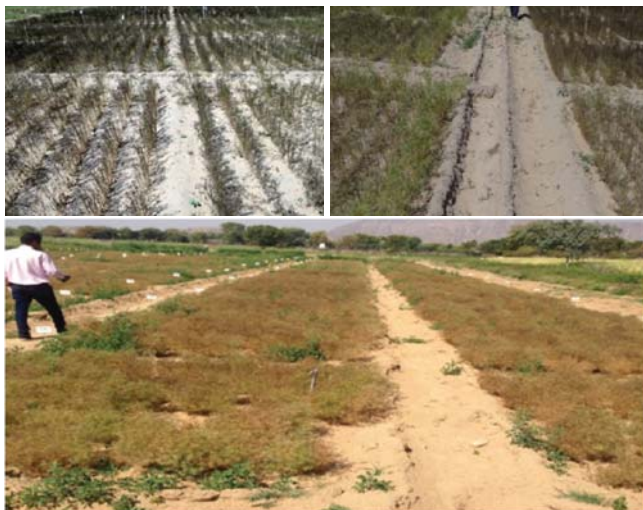
Blight disease affected cumin fields

In seed as well as in debris the pathogen remains viable for 10-12 months. Temperature ranging from 23-28°C is optimum for disease development. Cumin plants are generally attacked by A. burnsii after flowering. The plants infected with blight disease develop tiny necrotic spots, which becomes blackish later on. Most of the diseased plants do not produce seeds and even if they produce seeds, the quality is inferior. The highest blight incidence occurs in October sown crop.