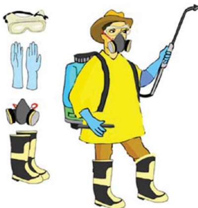
Protective clothing for workers